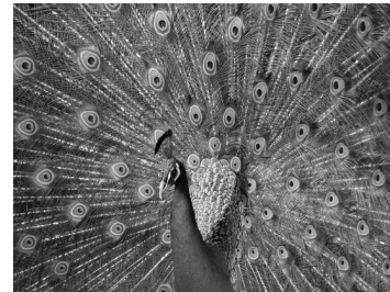
A peacock, being bad at escaping from predators

Gould wants us to ask the following question: why did we assume that these antlers couldn't be adaptive? Recall that when we discussed the usefulness of these antlers, we assumed at first that they would be for fighting. Since they would have been bad weapons for attack, and bad shields for defense, they must not have been adaptations. But that's not the only thing they could have been for. Another example of sexual selection, one that Darwin had also used, was peacock feathers. The tails of peacocks make it much easier for them to be caught by predators, but if displaying them makes them