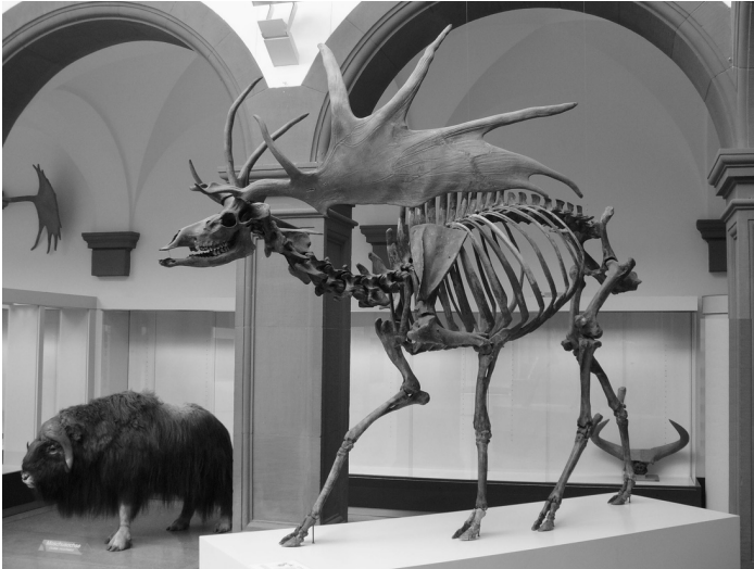
A fossil Irish elk

All of this will be easier with an example, so let's look at a spectacular one: the Irish elk. Also known by the name of its genus, Megaloceros , it is notably not an elk, and didn't only live in Ireland. (Some people call it the "giant deer" instead.) Its main feature is obvious: giant antlers. The antlers of the Irish elk could grow up to 40 kg (88 lb) in weight, and as large as three and a half meters (12 feet) in width.