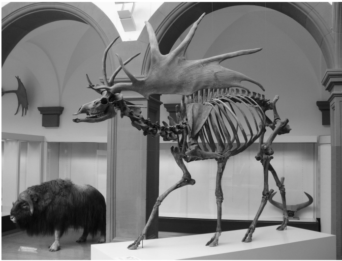
A fossil Irish elk

All of this will be easier with an example, so let's look at a spectacular one: the Irish elk. Also known by the name of its genus, Megaloceros , it is notably not an elk, and didn't only live in Ireland. (Some people call it the "giant deer" instead.) Its main feature is obvious: giant antlers. The antlers of the Irish elk could grow up to 40 kg (88 lb) in weight, and as large as three and a half meters (12 feet) in width.