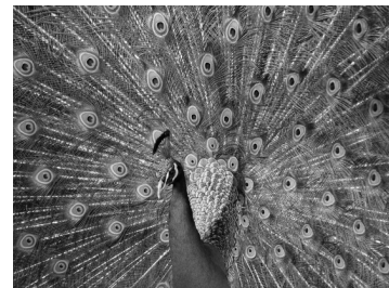
A peacock, being bad at escaping from predators

Gould wants us to ask the following question: why did we assume that these antlers couldn't be adaptive? Recall that when we discussed the usefulness of these antlers, we assumed at first that they would be for fighting. Since they would have been bad weapons for attack, and bad shields for defense, they must not have been adaptations. But that's not the only thing they could have been for. Another example of sexual selection, one that Darwin had also used, was peacock feathers. The tails of peacocks make it much easier for them to be caught by predators, but if displaying them makes them more attractive to peahens, then again, the cost might be worth it. Maybe Irish elk's antlers were good as ornamentation, to impress potential mates. Or perhaps the combat isn't about real combat , but rather about ritual, where deer engage in mock battles, in which the animal with the smaller horns, because it already knows it's going to lose, eventually submits to defeat. Both of these seem like very plausible explanations that invoke only natural selection. And then the extinction of Megaloceros doesn't need any kind of special interpretation. It was just a change in climate, as the glaciers that had covered much of their range retreated, that caused them to go extinct.