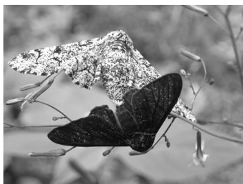
A pair of peppered moths, one each of the light and dark form

Do you think this kind of reductionism is correct, or not? What advantages and disadvantages are produced by an explanation in terms of chemistry, as opposed to a biological explanation? What might this mean for how we think about the relationships between scientific fields?