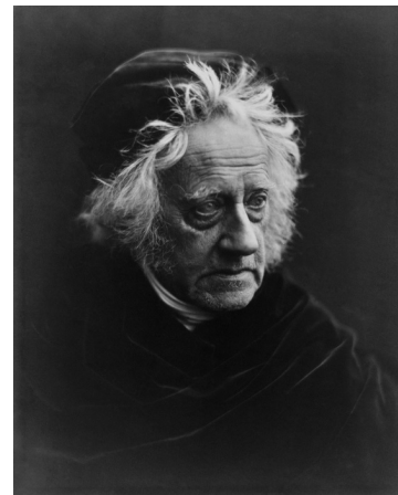
Sir John Herschel, photographed by famed photographer Julia Margaret Cameron

In chapter 5 of the Origin , Darwin is writing about what it is that causes variations – why do offspring not look exactly like their parents? This variation is crucial to evolutionary theory, since we won’t see production of new adaptations if we never see the right kinds of variations. But Darwin doesn’t have our understanding of genetics, much less our understanding of DNA, so in fact he didn’t know how variations came about. All he could say was that it seemed clear that they were generated (as made clear by our success in agriculture, for instance).